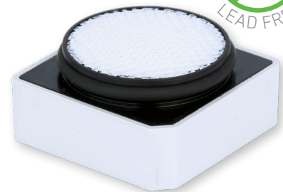
Oxygen (O 2 ) Sensor: iO2 Part Number: AAW85-07WD-CIT